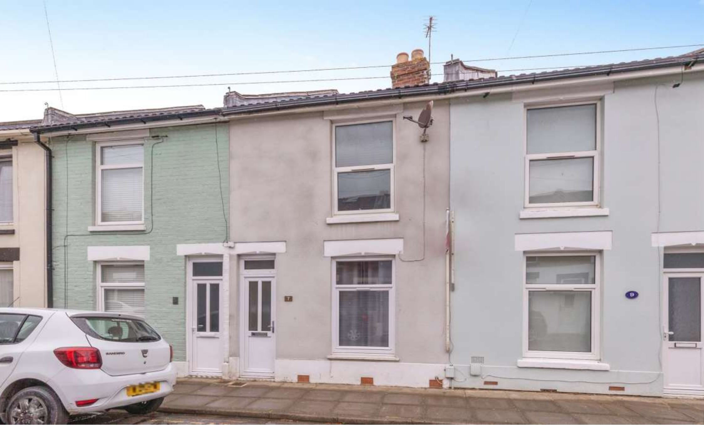
Clarke's Road, Portsmouth PO1 5PR