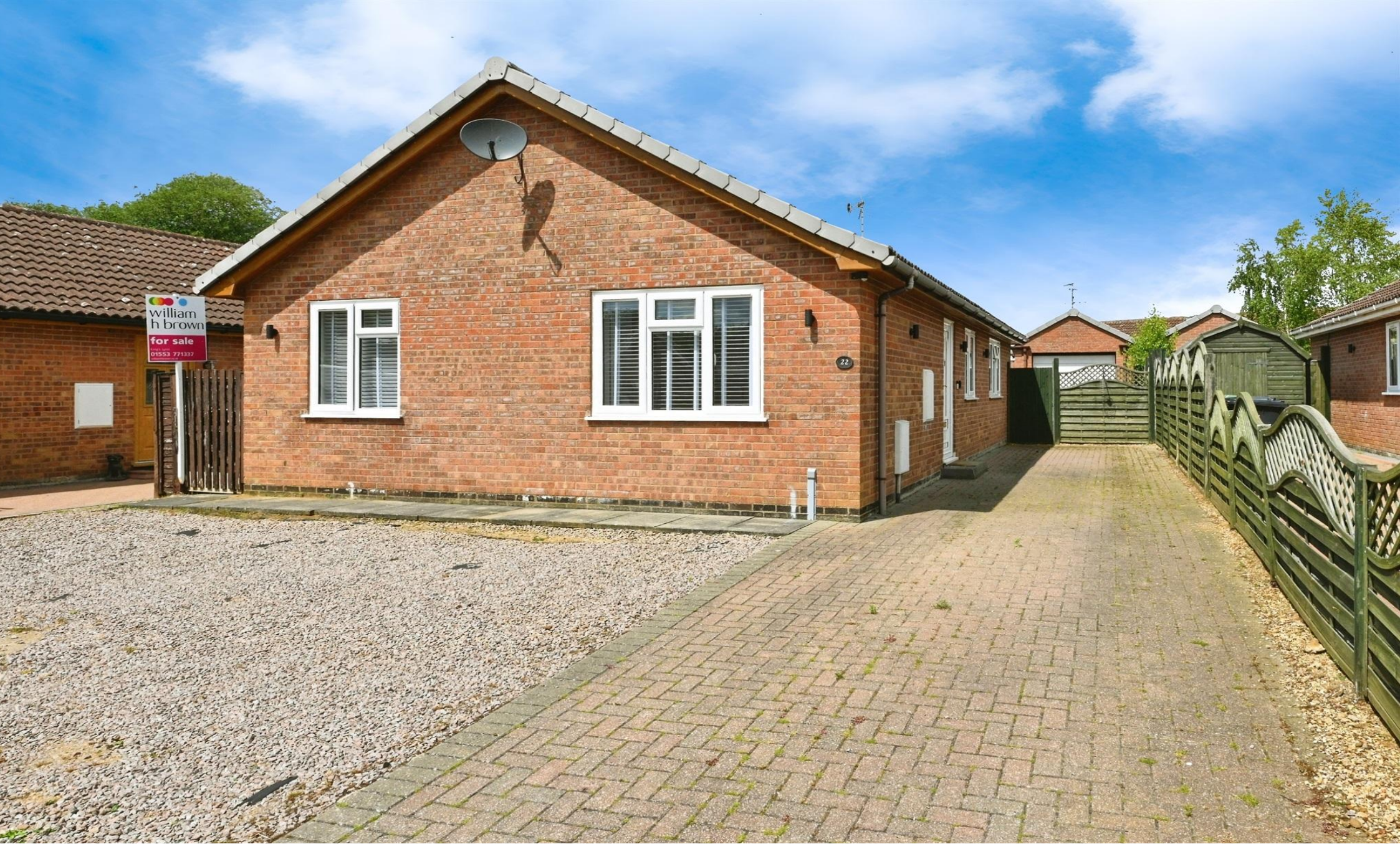
Euston Way, South Wootton, King's Lynn, PE30 3TX