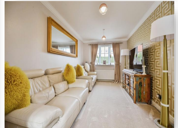
Rosemoor Close, Marton-In-Cleveland Middlesbrough TS7 8LQ