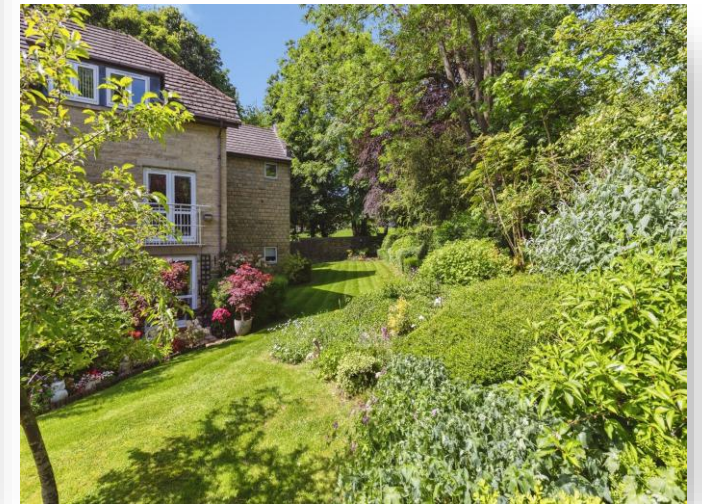
Sutton Court Beech Street, Bingley BD16 1HF