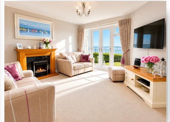
Sussex Court, Vanguard Road, Gosport, PO12 4FF