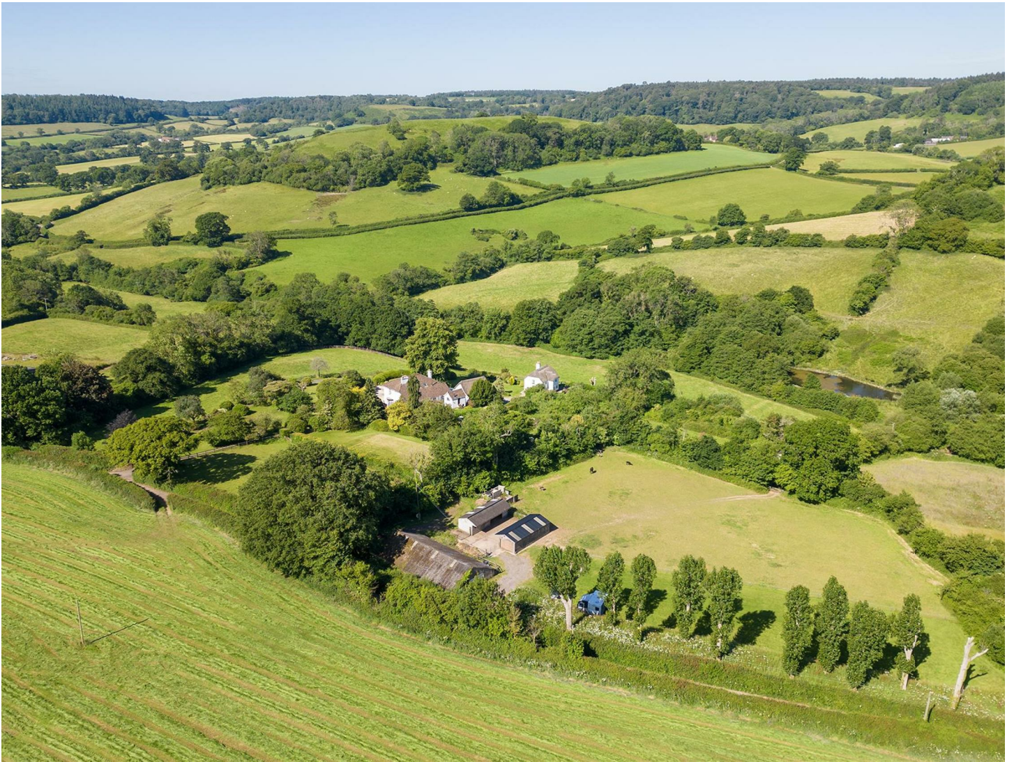
Barn at Springfield