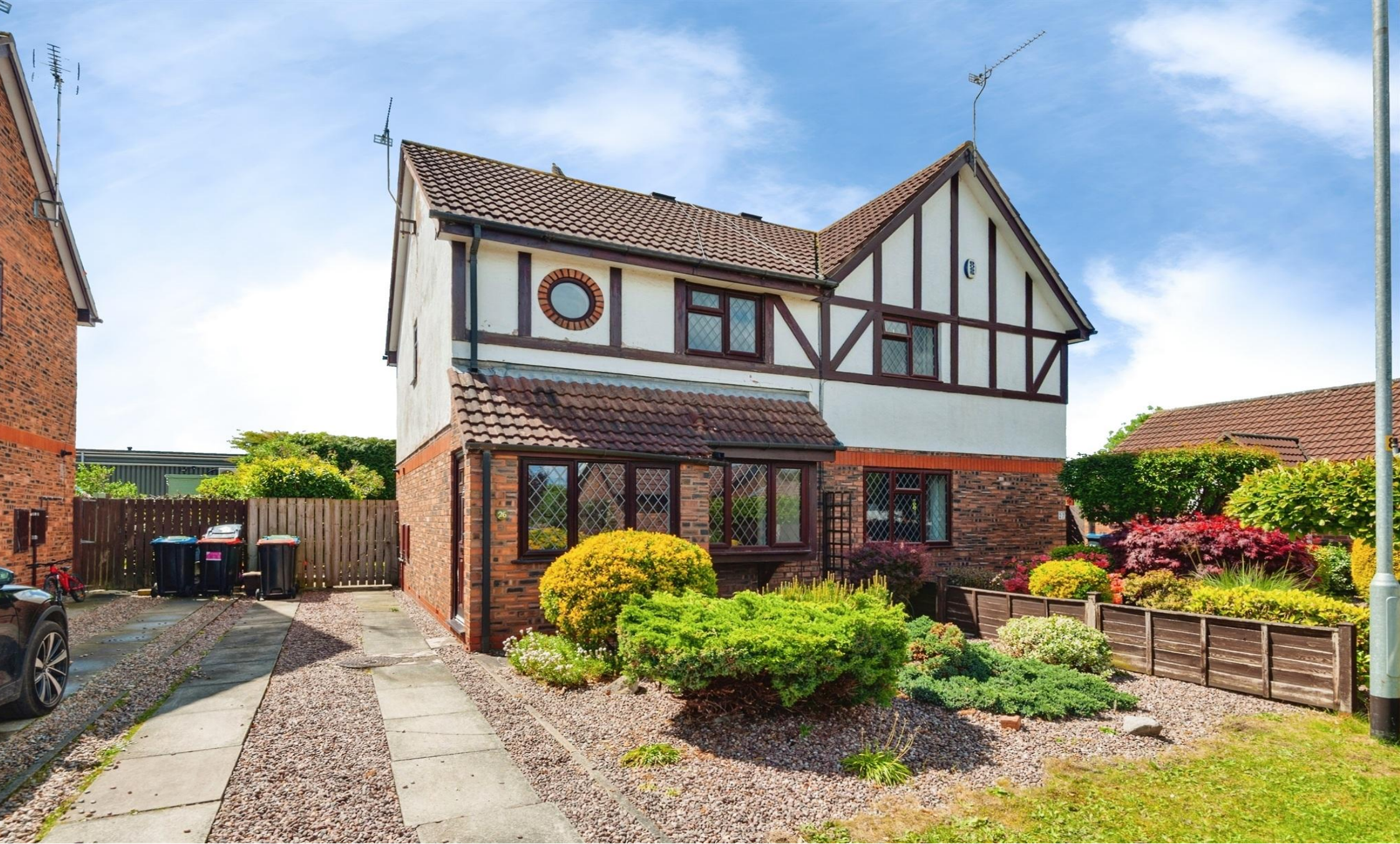
Lodge Hollow, Helsby Frodsham WA6 0BX