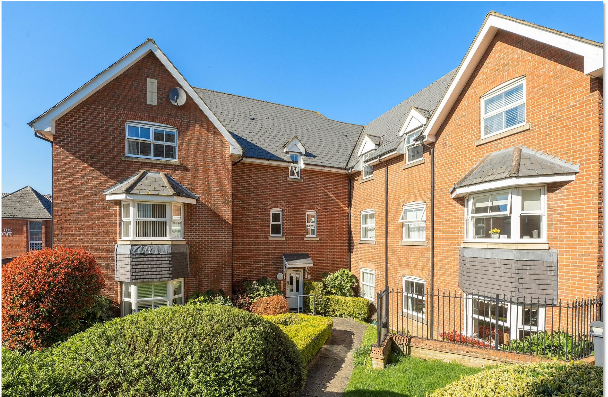
Pope Court Gowers Yard, Tring HP23 4FD