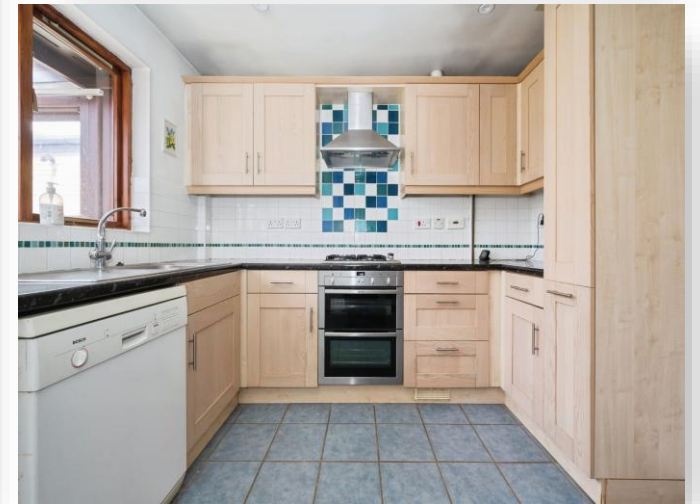
Cerne Close, West End, Southampton SO18 3NG