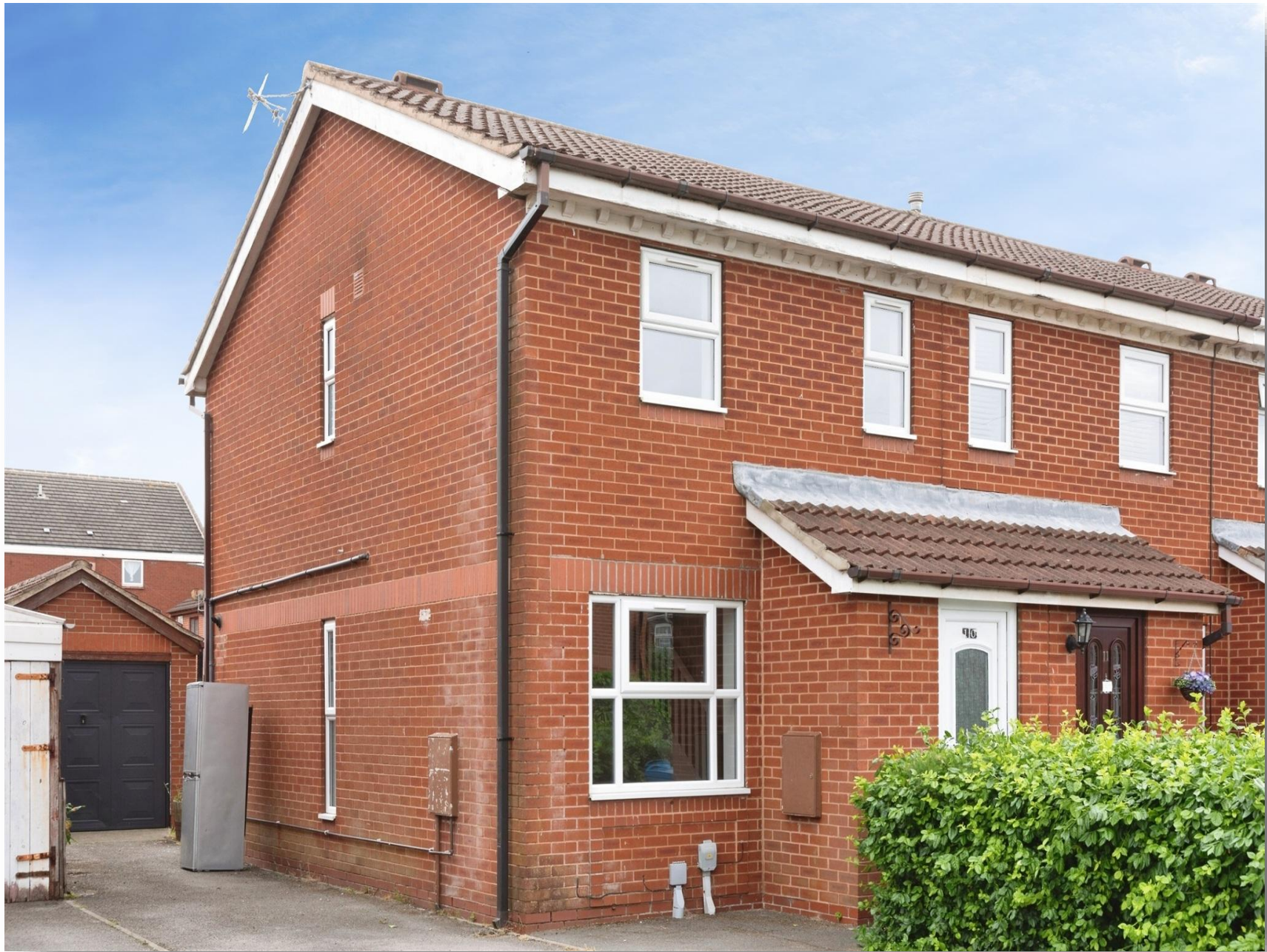
James Niven Court, Hull, HU9 3AQ