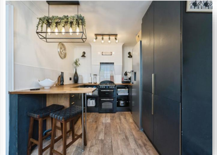
Knightswood, Manns Close, West End Southampton SO18 3DH