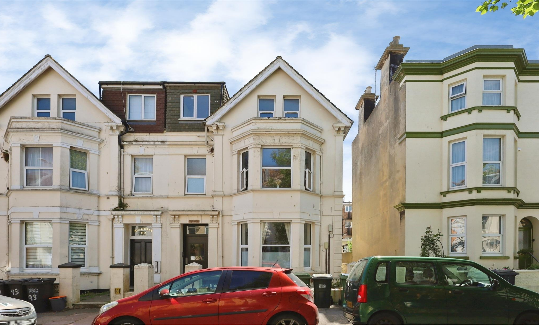
Baigs House Pevensey Road, Eastbourne BN22 8AD