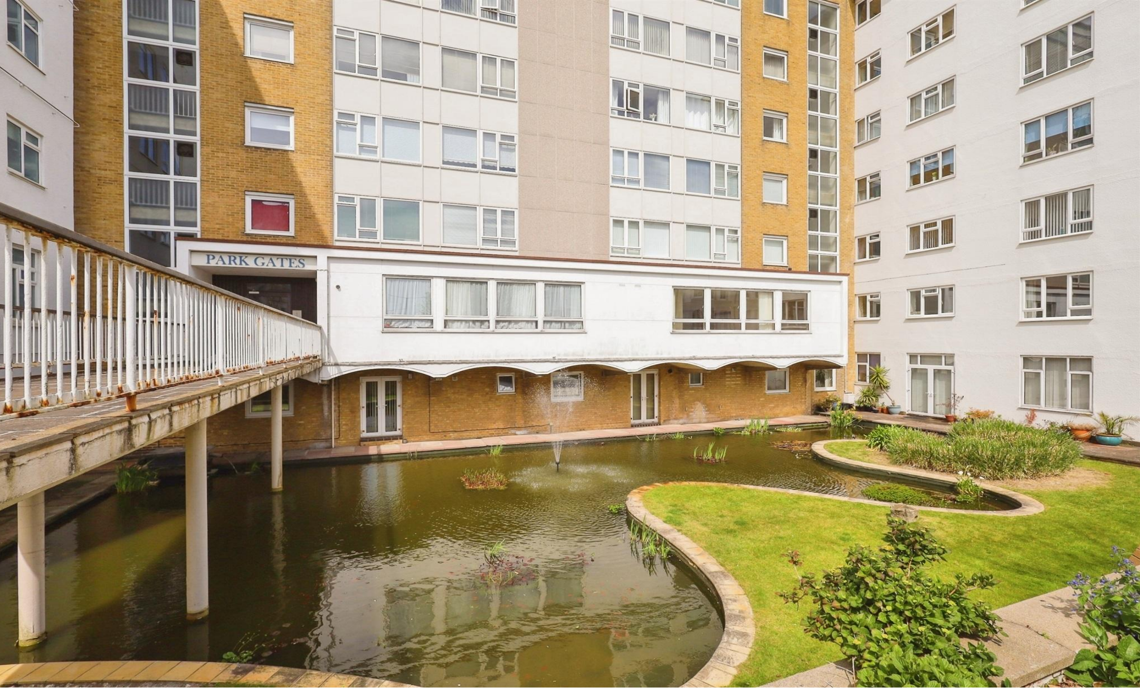
Park Gates Chiswick Place, Eastbourne BN21 4BD