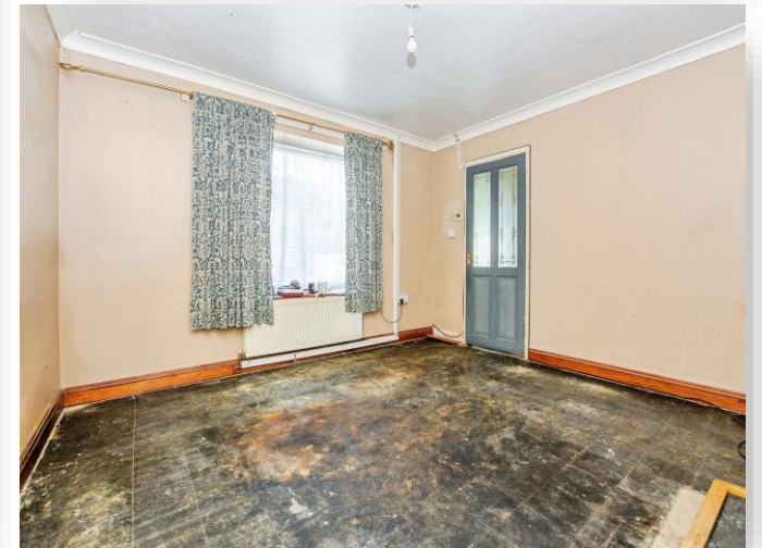
Cocketts Drive, Wisbech PE13 2JS