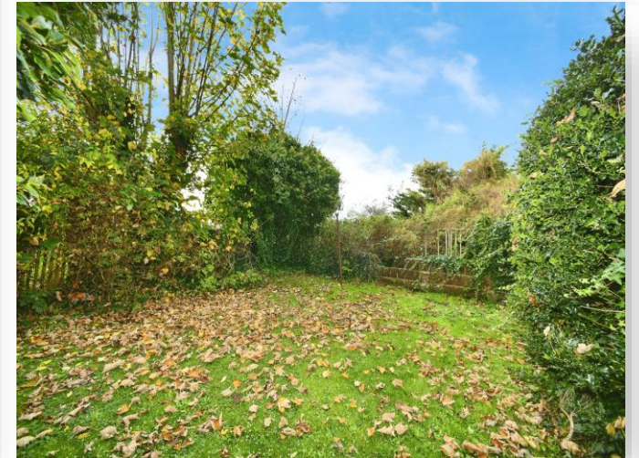
Widdicombe Way, Brighton BN2 4TH