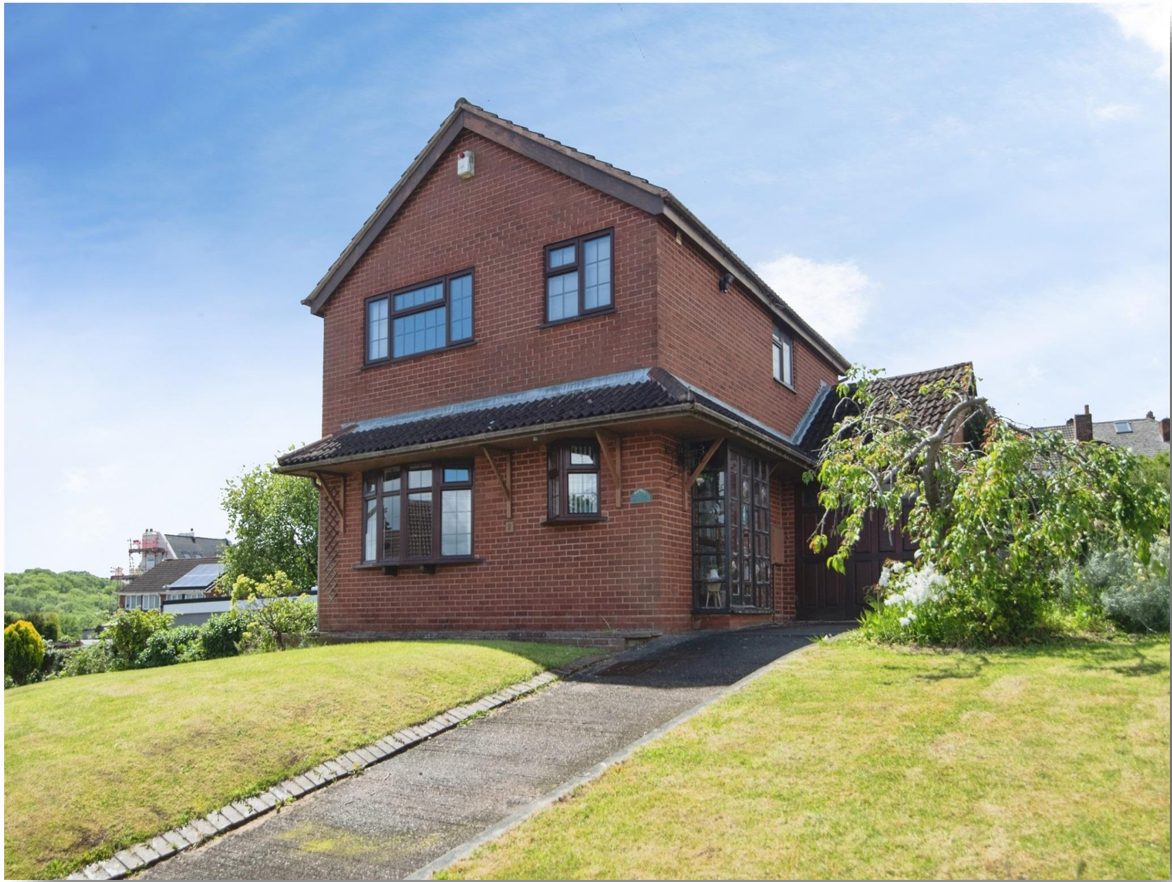
Parkes Lane, Dudley DY3 1AQ