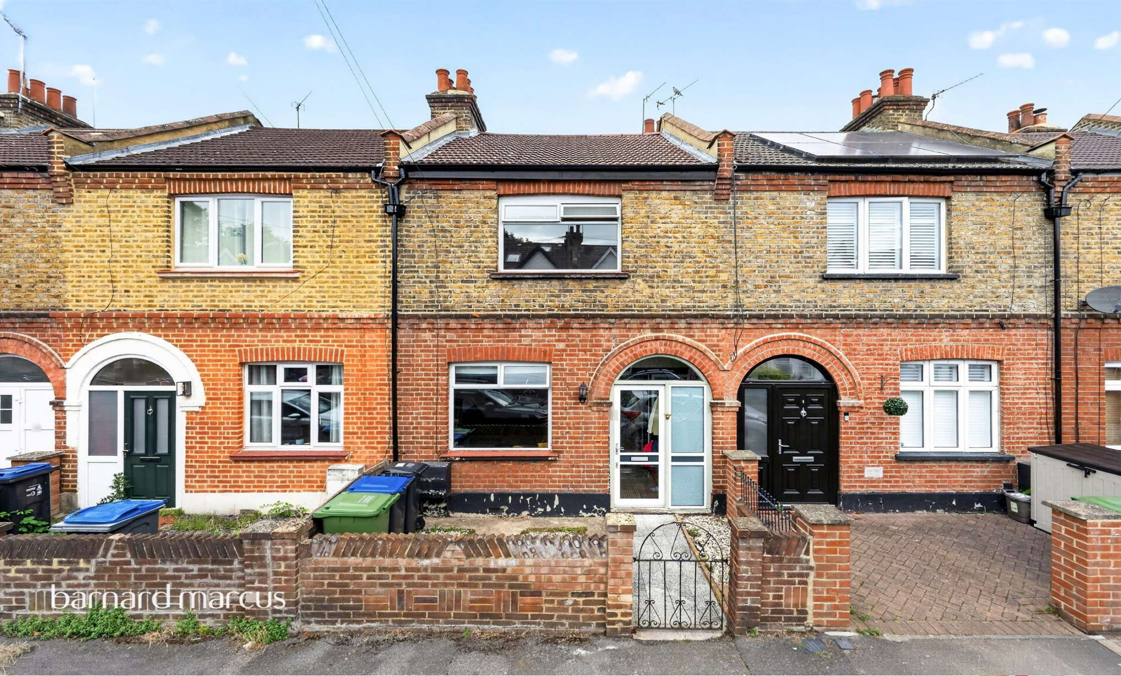
Beresford Road, New Malden, KT3 3RQ