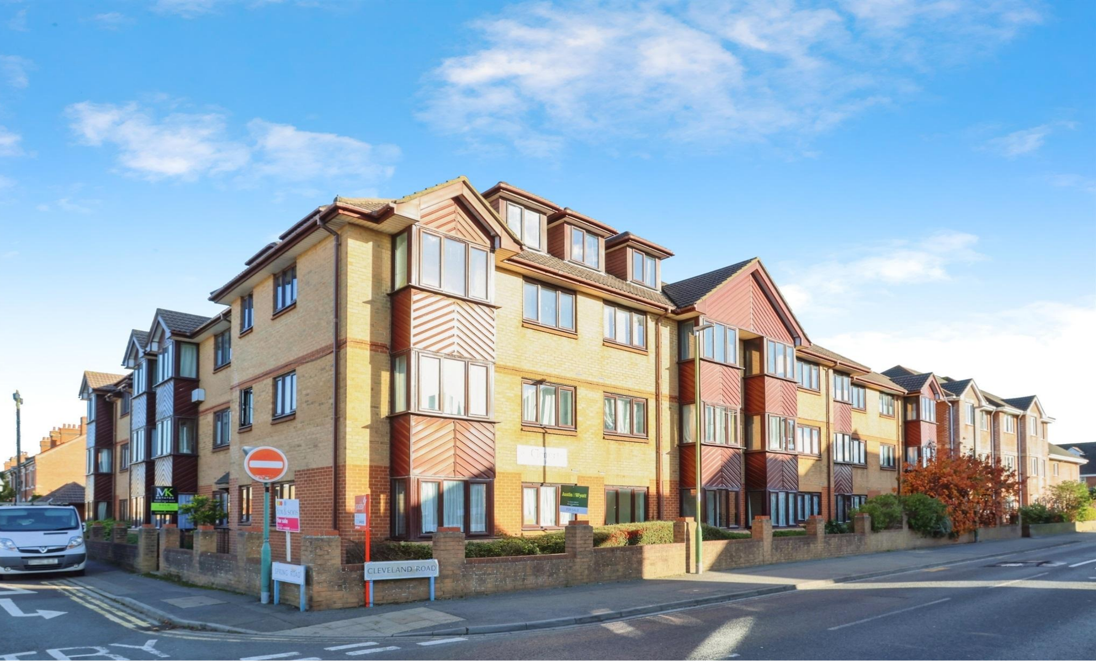
St. Clements Court Cleveland Road, Bournemouth BH1 4QJ