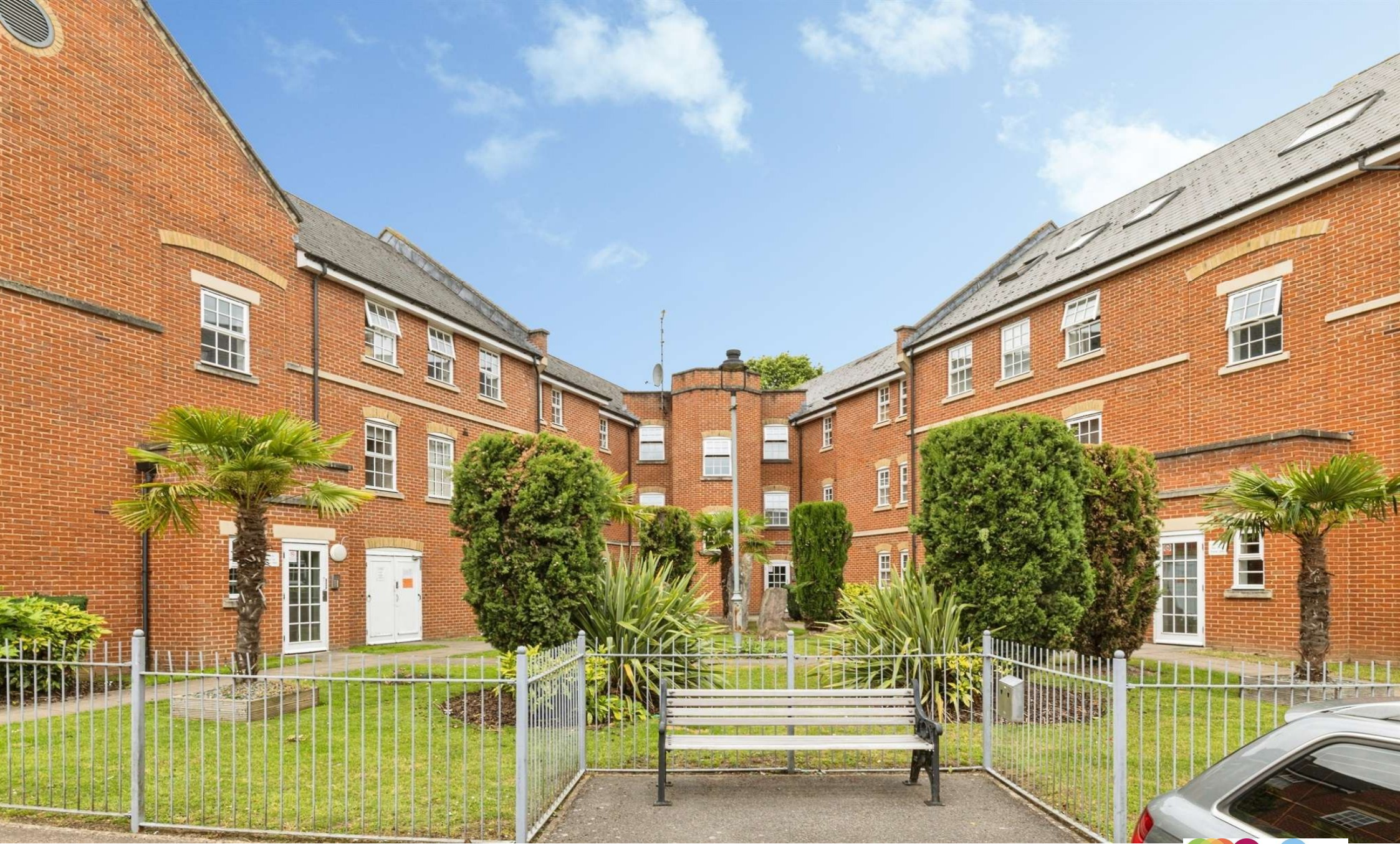
Florey Gardens, Aylesbury HP20 1RW