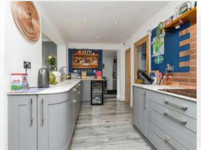
Royston Grove, Hartlepool TS25 2JW