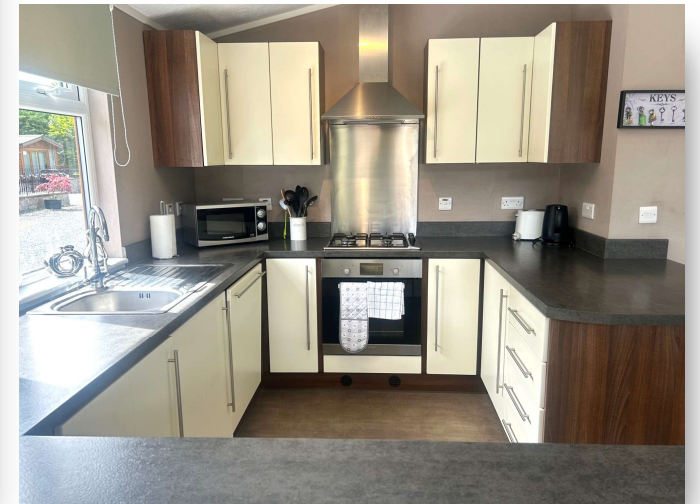
Grand Eagles, Auchterarder, PH3 1ET