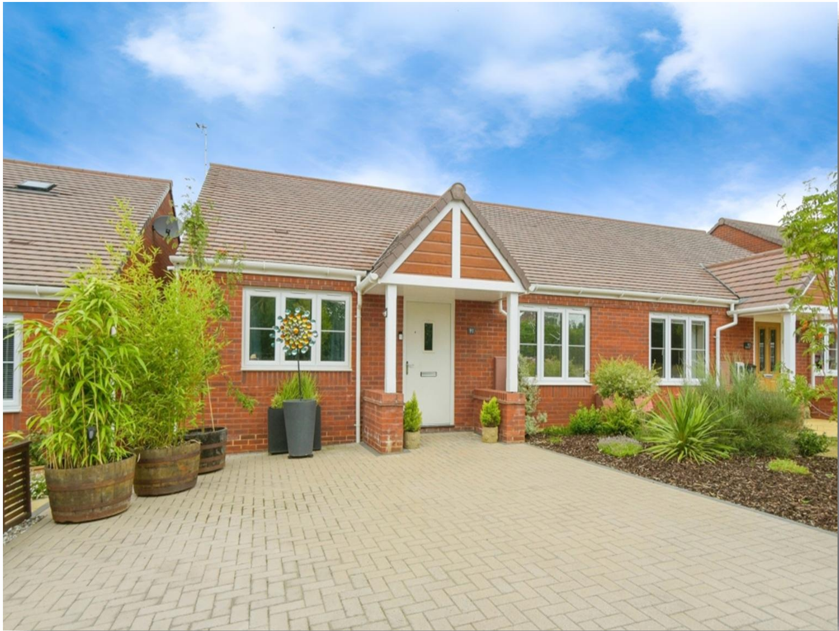
Cozens Grove, Shrivenham Shrivenham SN6 8FS