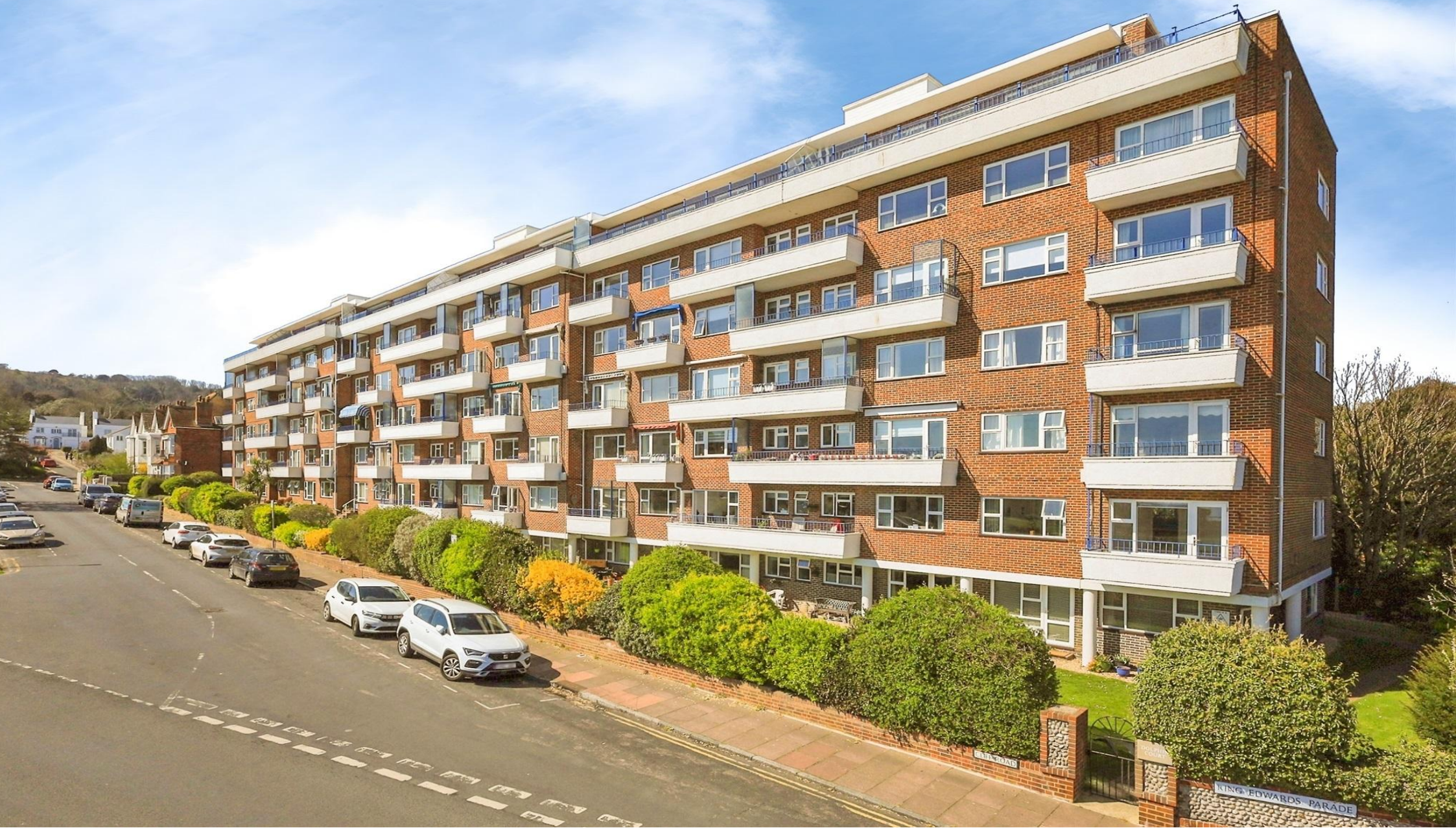
Dolphin Court Cliff Road, Eastbourne BN20 7XF