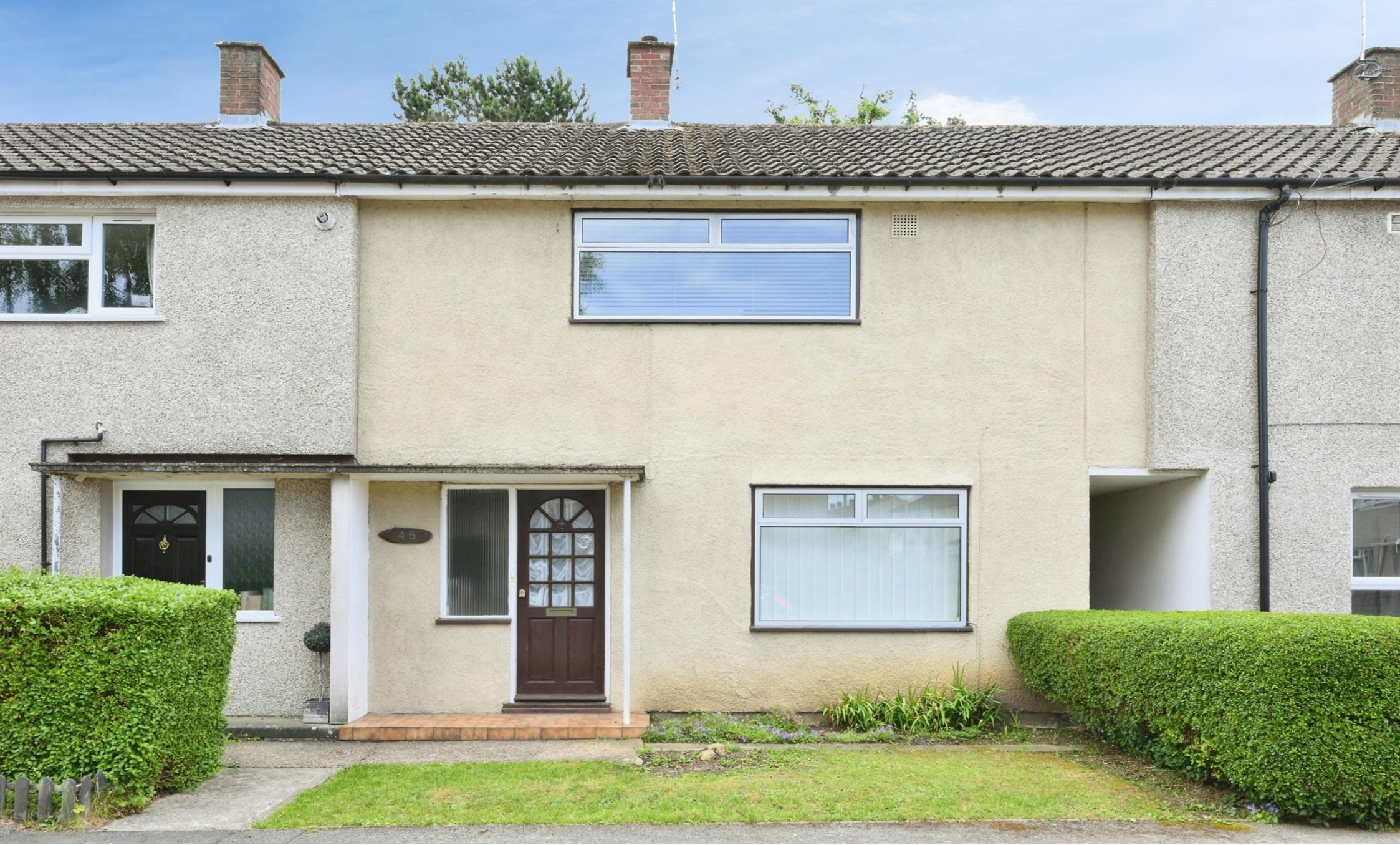
Long Ley, Harlow CM20 3NL