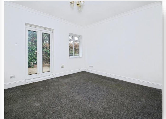
Clarence Road, PETERBOROUGH PE1 2LB