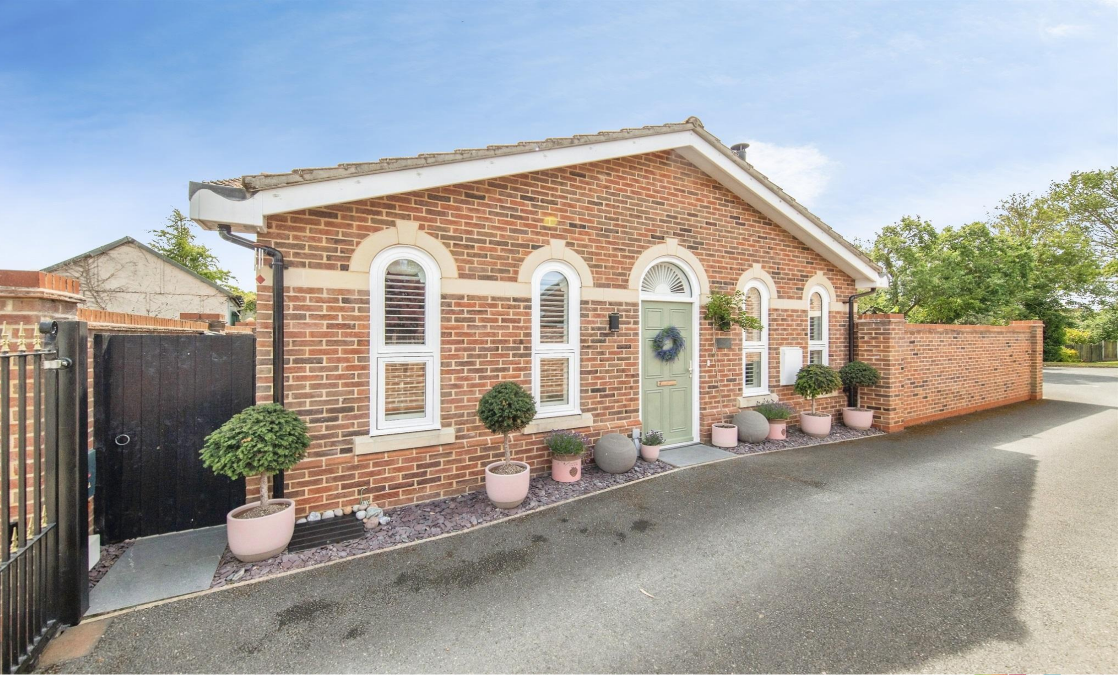
The Gate House High Street, Thorpe-Le-Soken Clacton-On-Sea CO16 0EA