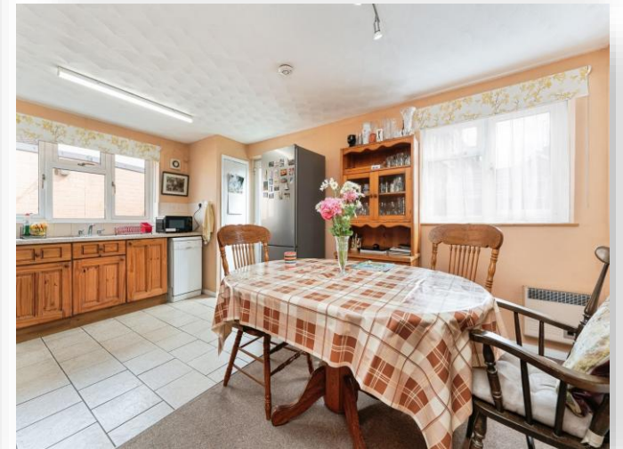
Woodfen Road, Littleport CB6 1JP