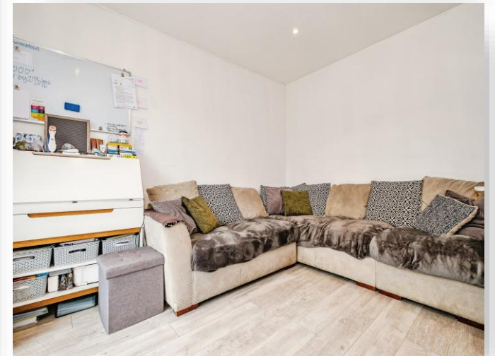
Alandale Road, Sompting LANCING BN15 0JU