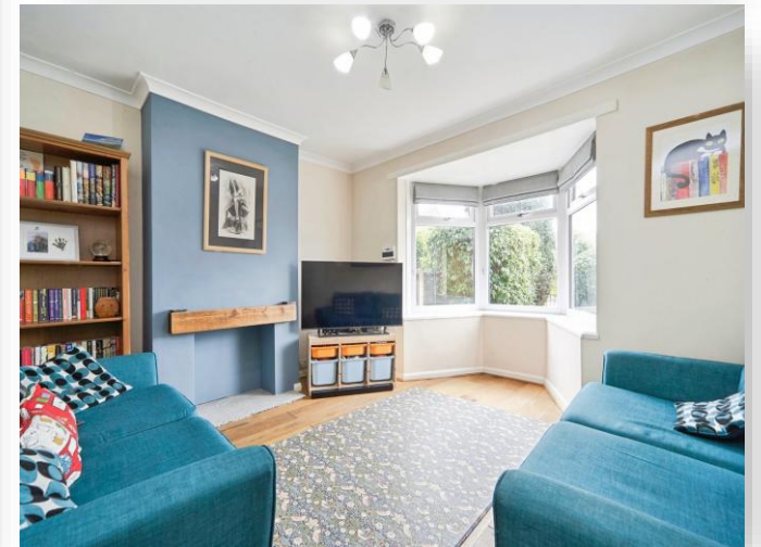
Cockshott Lane, LEEDS LS12 2RQ