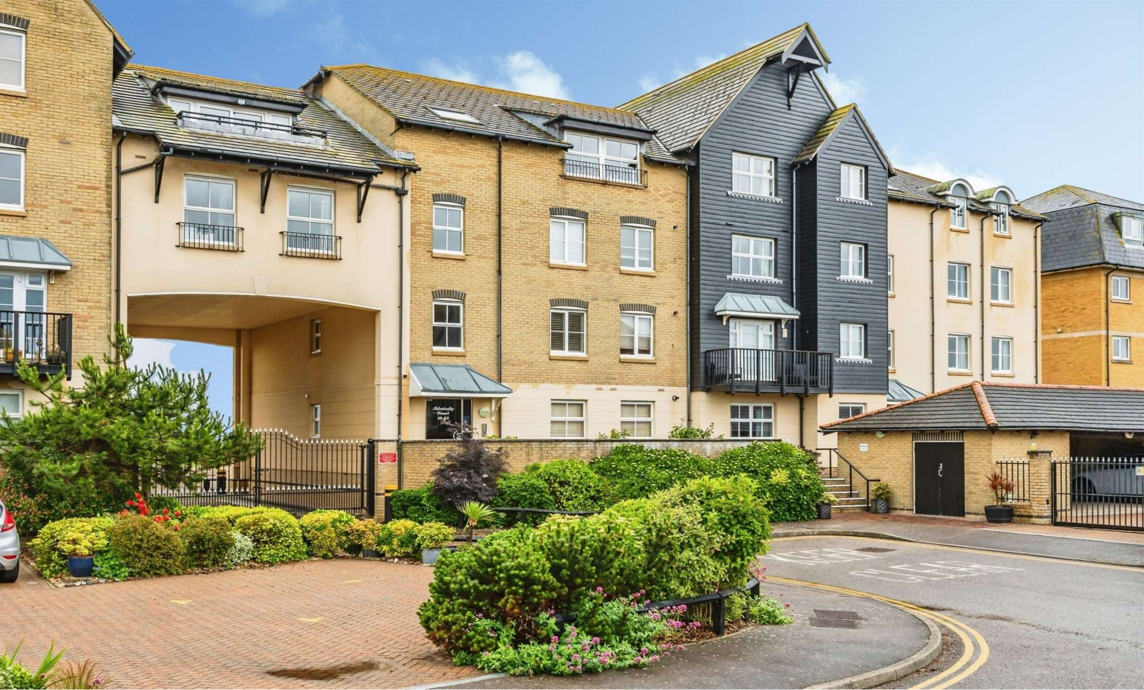
Admiralty Court Admiralty Way, Eastbourne BN23 5PW