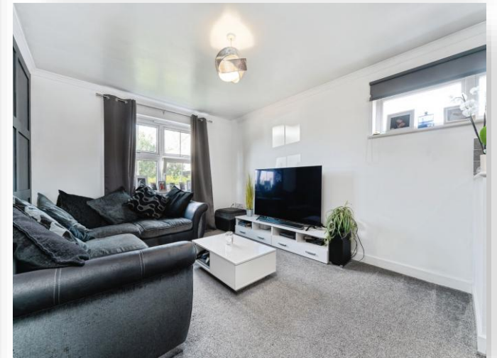
Florence House, Main Street, Witchford CB6 2HP