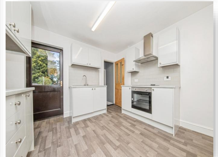
Lancaster Road, Ipswich, IP4 2NY