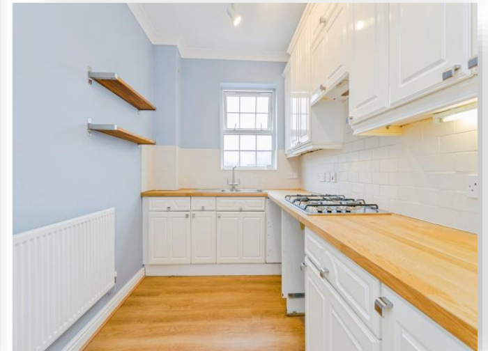
Llwyn Passat, PENARTH, CF64 1SE