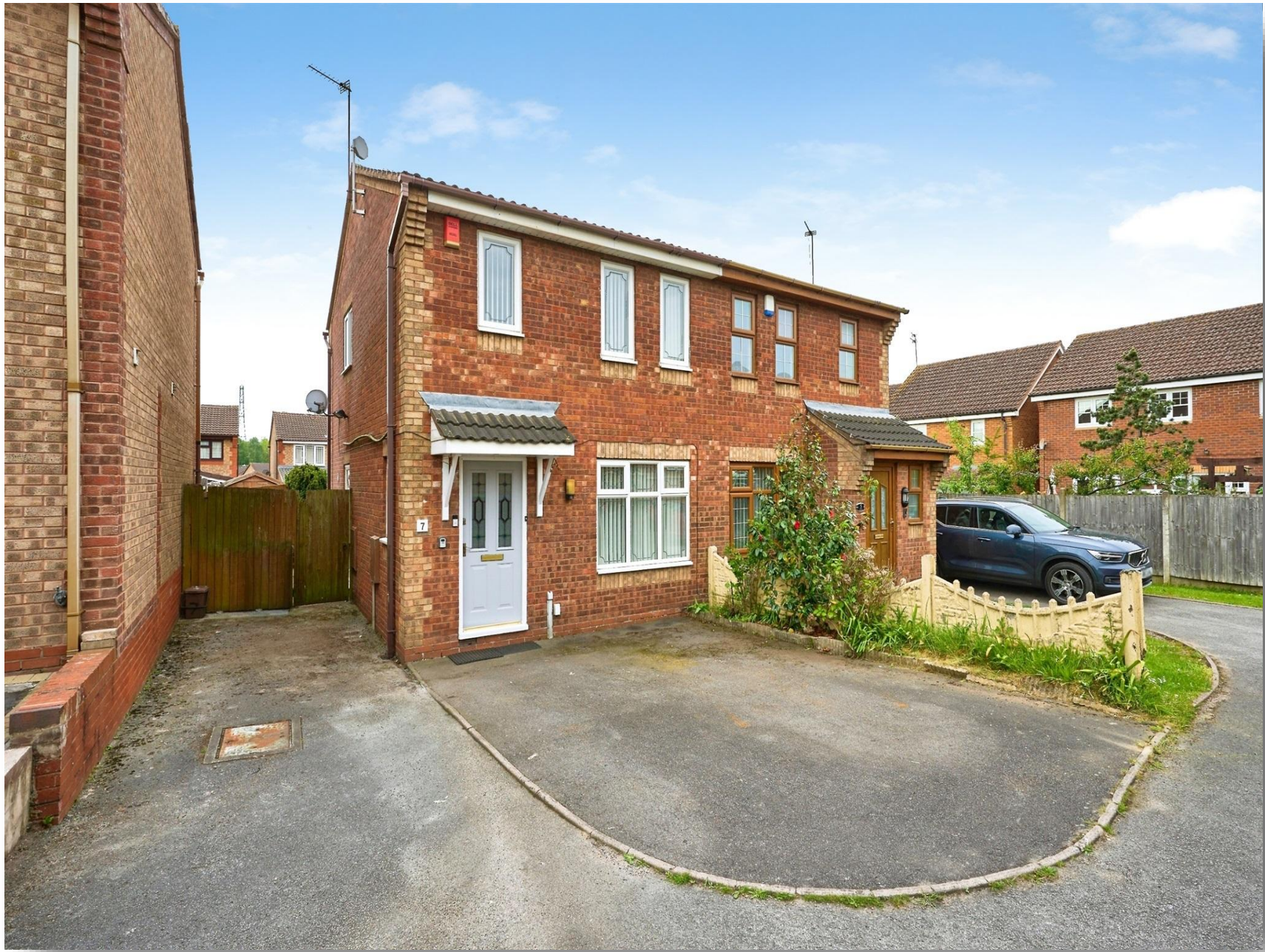
Oxlip Close, Walsall WS5 4RD