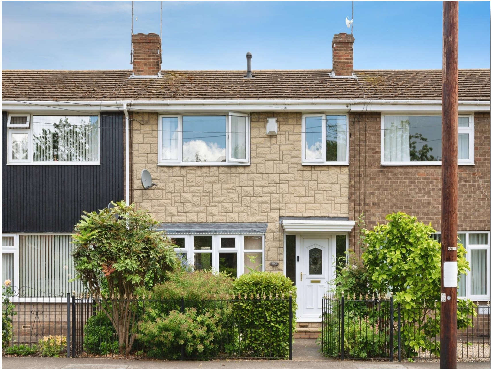
Marfleet Lane, Hull, HU9 4TL