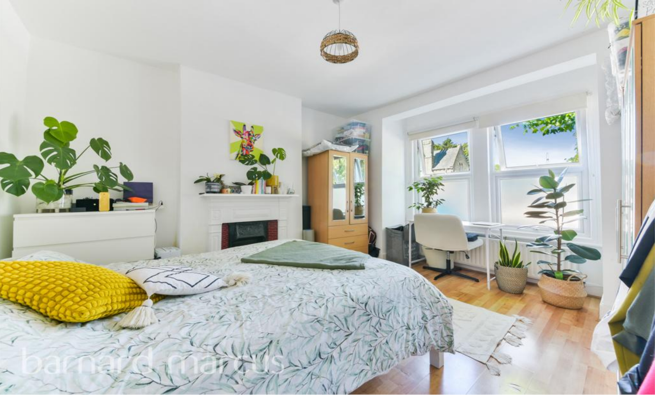
Blackshaw Road, London SW17 0BU