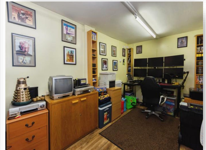
Tibbats Close, Birmingham B32 3TF