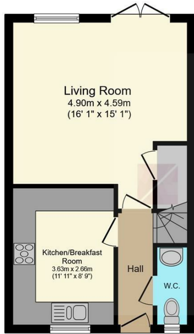
Ground Floor Floor area 36.5 sq.m. (392 sq.ft.)