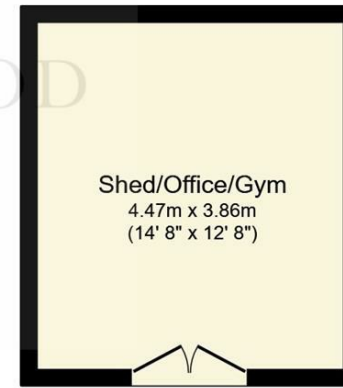
Outbuilding Floor area 17.7 sq.m. (190 sq.ft.)

Total floor area: 90.6 sq.m. (975 sq.ft.)