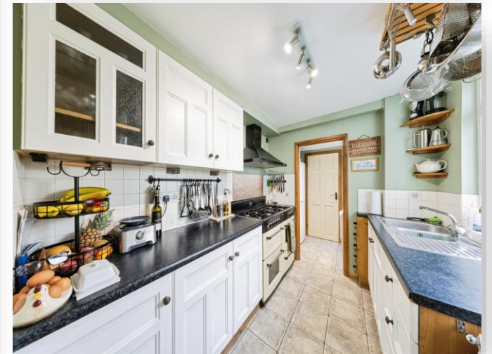
Greenfield Road, Newport Pagnell, MK16 8DB