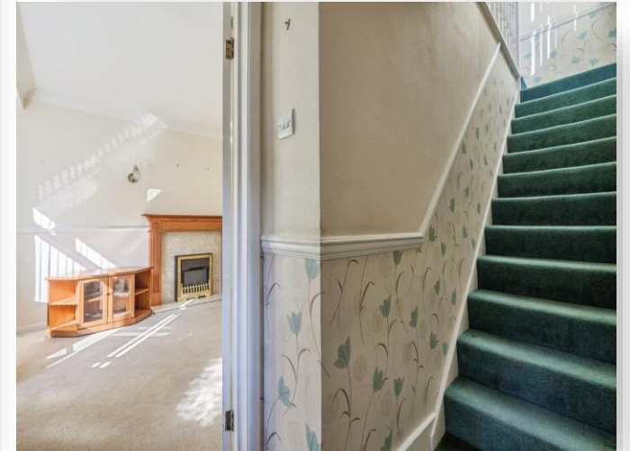
Merafield Drive, Plympton PL7 1TP