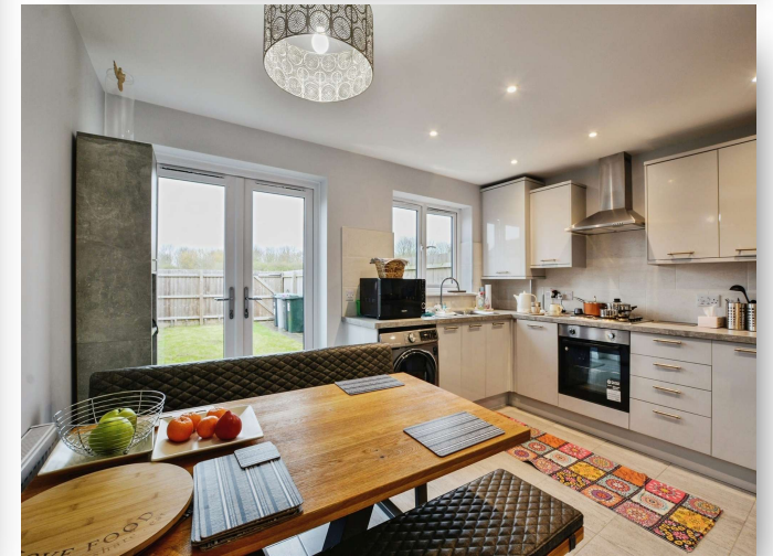
Greenland Square, Skegness PE25 2FF