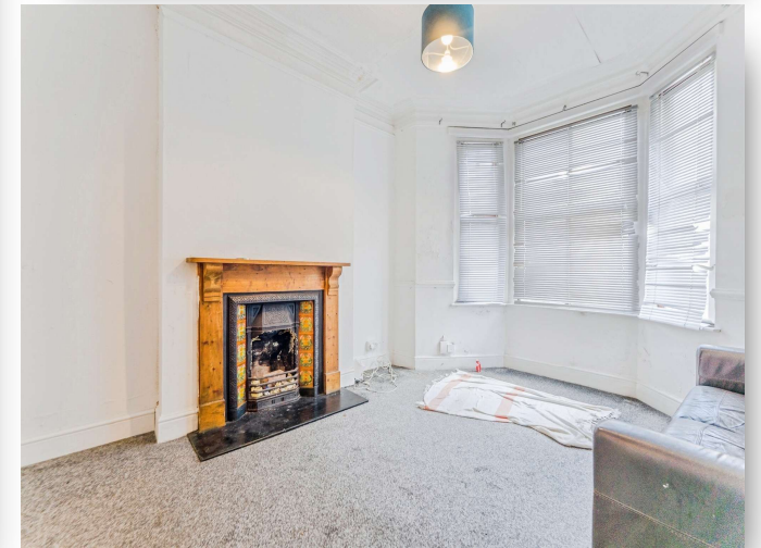
Moorland Road, Splott Cardiff CF24 2LF