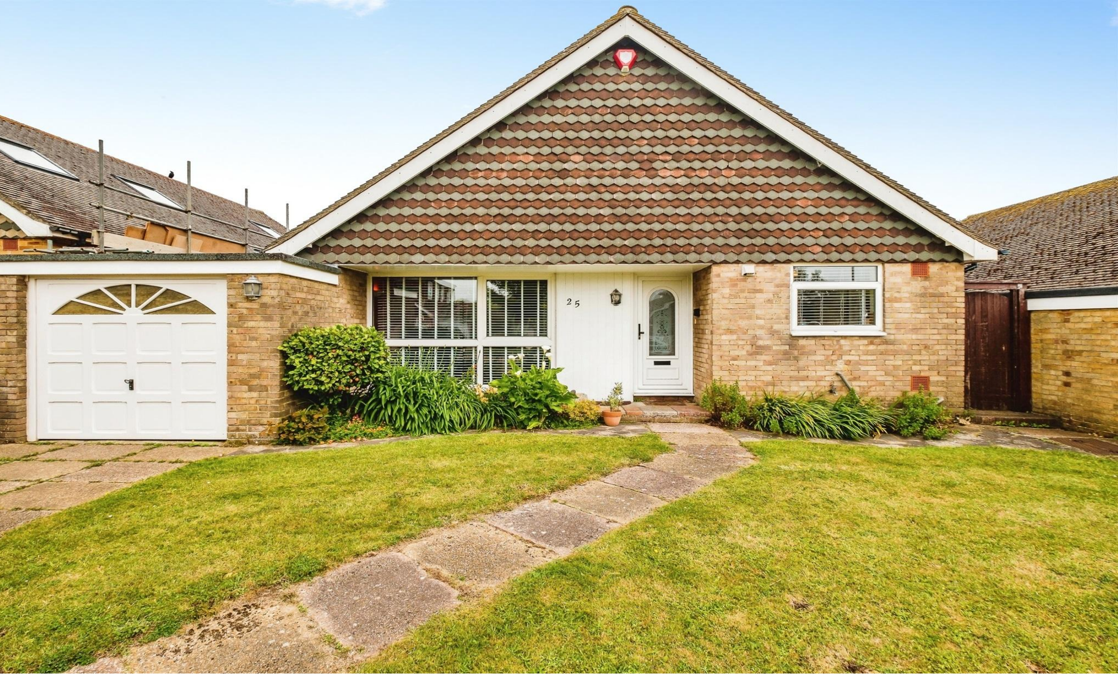
Mulberry Close, Shoreham-By-Sea BN43 6TF