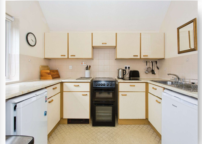
68 Windmill Grange, Windmill Lane, Histon, CB24 9JF