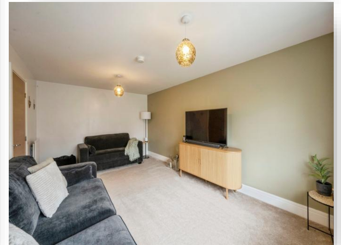
Bella Avenue, Goldthorpe Rotherham S63 9GT