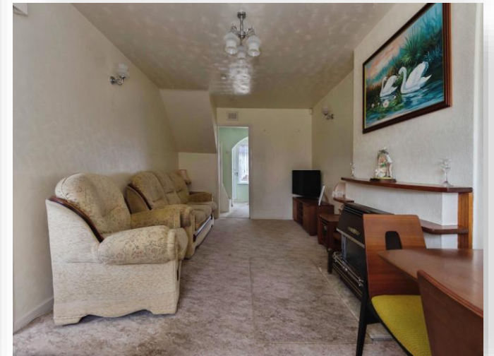
Pinewood Drive, BIRMINGHAM B32 4LG