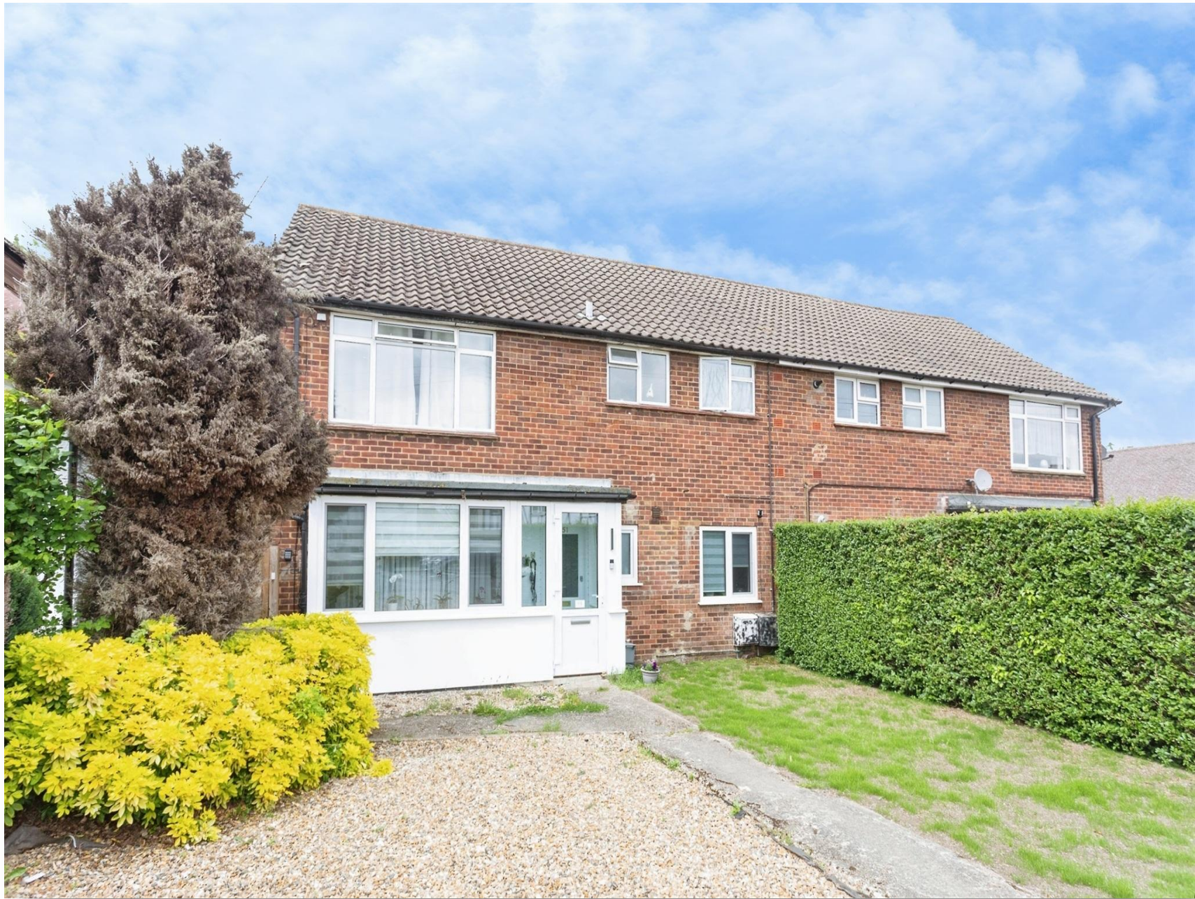
Watford Road, Croxley Green, Rickmansworth, WD3 3ED