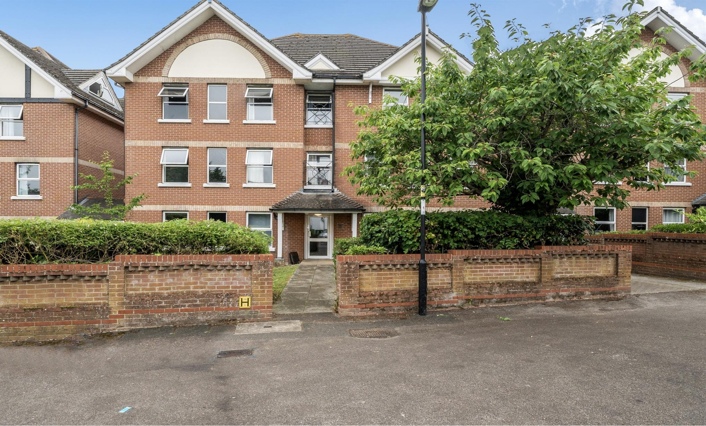
Chatsworth House, Westridge Road, Southampton SO17 2HD