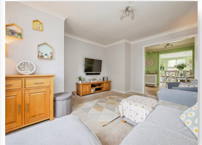
Churchill Close, Hevingham, Norwich, NR10 5PA