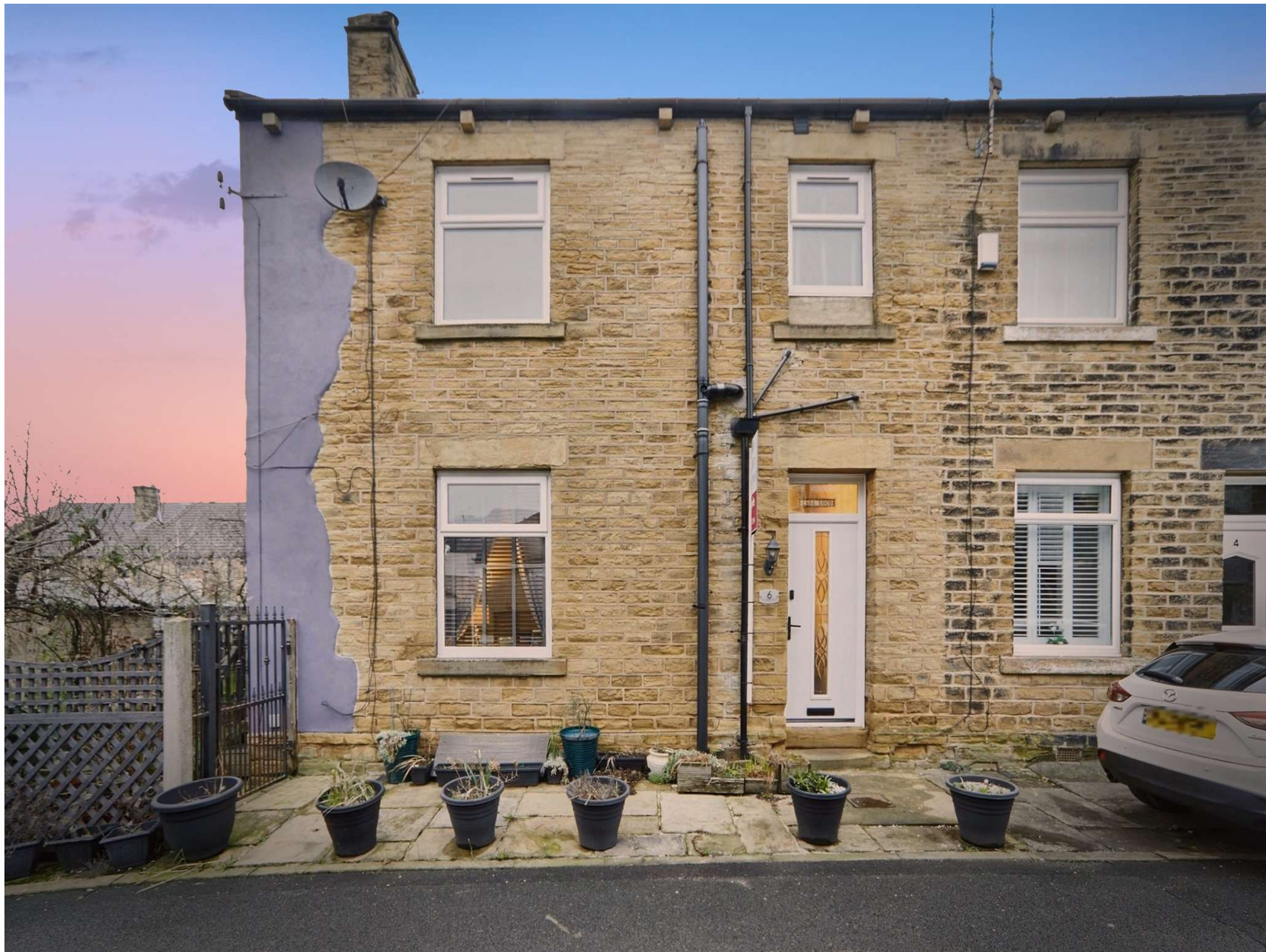
Providence Place, Stanningley Pudsey LS28 6AE